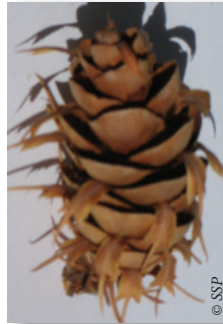
DOUGLAS FIR CONE

Can you find this tree's cone? It is around 3 inches long and displaying tri-tipped bracts beneath its scales. The bracts are often described as the back feet and tail of a mouse trying to hide. In addition, the cones hang below the tree's branches, belying the fact that the Douglas fir is actually NOT a true fir. The cones of a true fir stand upright.