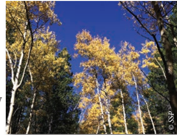
ASPENS IN FALL

From here you will also notice a beautiful stand of aspen trees. Each Autumn the aspens' leaves turn from bright green into a notable golden hue, yielding magnificent photo-ops and works of art. Plan to hike the park again in the fall to marvel in their beauty. In addition to being beautifully colored, aspens are different in the fact that they grow separate male and female trees. Also, their root systems can remain inactive for years and begin to sprout when given the ideal conditions.