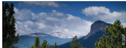
VIEW OF LION'S HEAD

That rounded outcropping you see in the distance is one of Staunton's signature scenic formations, Lion's Head. You can hike, mountain bike or ride horseback the eleven-mile round trip. On your way up you may choose to picnic at Elk Falls Pond before ascending Lion's Back Trail. And be sure to take in the breathtaking view of the Elk Falls that cascades across the canyon from the summit. It's one of the longest routes through our park, but the scenery is well worth the adventure.