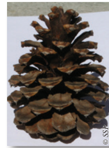
FEMALE PINE CONE

Observe the beautiful Ponderosa pine! Growing at altitudes of 5,000 ft. to 8,500 ft. above sea level, the Ponderosa is the most common pine tree in this part of Staunton.