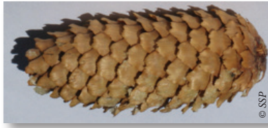
BLUE SPRUCE PINE CONE

You're now standing under Colorado's state tree, the Blue Spruce. A spruce is often times described as being "sharp." Its sharpness comes from the short, stiff needles on its branches. Take one of the needles and roll it in your fingers, you will feel that it is square. A helpful alliteration to make spruce identification easier: SPRUCE = SHARP=SQUARE.