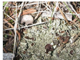
CHOCOLATE CHIP LICHEN

If you've run your hands along any rocks along the trail, you may have felt both a soft, dark green moss and a rougher, flakier substance. The latter growth is called lichen (pronounced LI-ken), and it is actually a combination of fungus and algae.